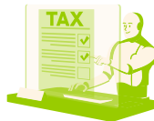
Default Tax Automation: