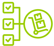
Purchase Order Consolidation

This project demonstrates how Zoho's flexibility can be harnessed to overcome limitations through custom development. By tailoring Zoho Inventory to WishMed's specific needs, we enabled them to achieve a more efficient and reliable inventory management system.