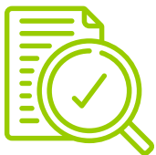
Mobile Proof of Delivery