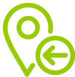
Automated Receiving Locations